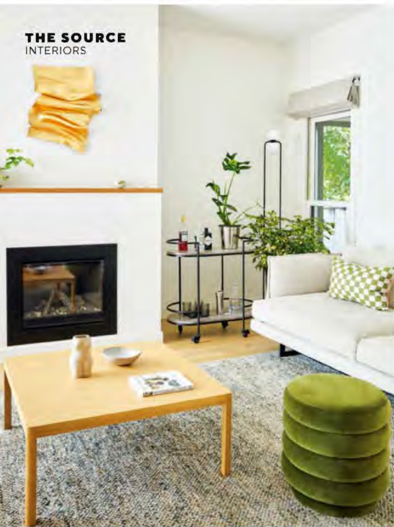
Images courtesy of Jasmine McClelland Design. Photography by Jonathan Tabensky. jasminemcclellanddesign.com.au